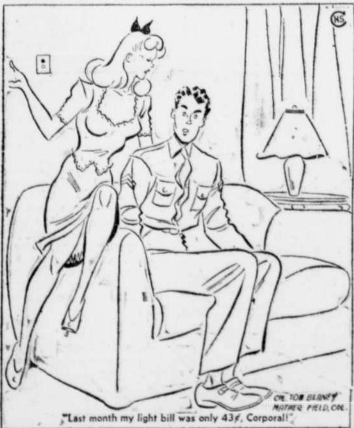
"Last month my light bill was only 43¢, Corporal!"