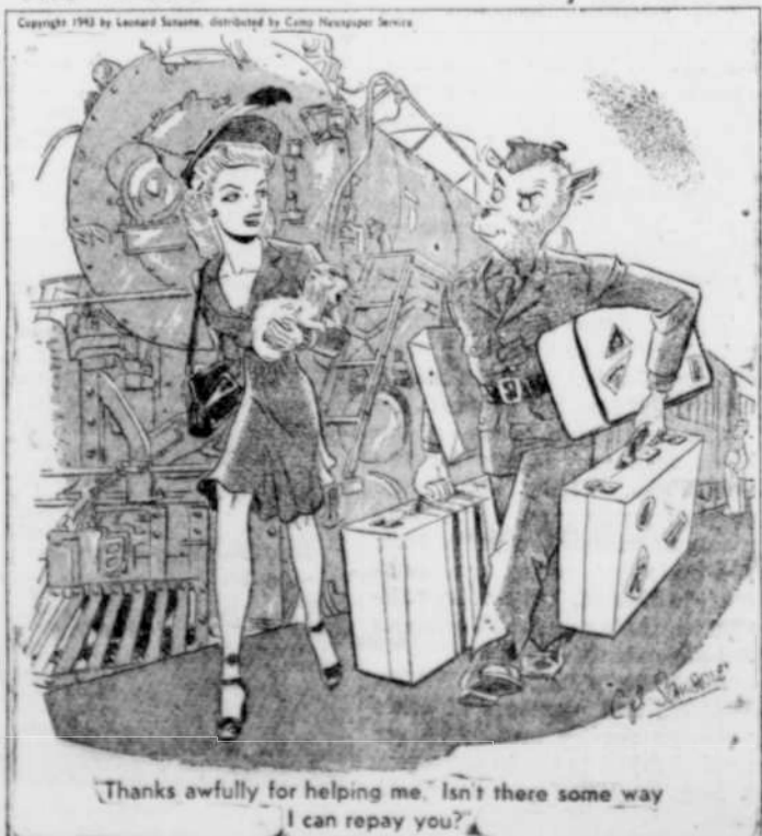
"Thanks awfully for helping me. Isn't there some way I can repay you?"