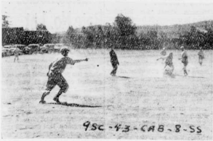
TENSE ACTION ON DIAMOND—Camp Abbot's varsity baseball team has fared well so far this season, winning four and losing three. Photo shows some heated action in a recent game.