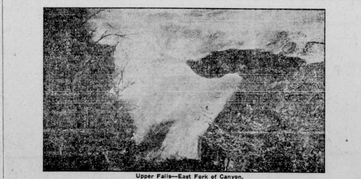
Upper Falls—East Fork of Canyon.

FOR SALE—At a bargain, 2 1-2 or 5 1-2 acres, all in good cultivation, fruit trees, strawberries under city water, six-room house on part of land. Apply to C. D. Rifner, 520 Terrace St.