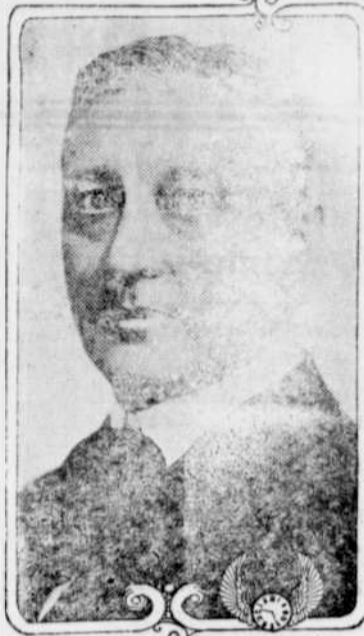
Henry C. Dixey, Star in the Mutual Masterpiece, De Luxe Edition, "The Alien."

Another important announcement is only held up pending completion of the arrangements and fixing of dates.