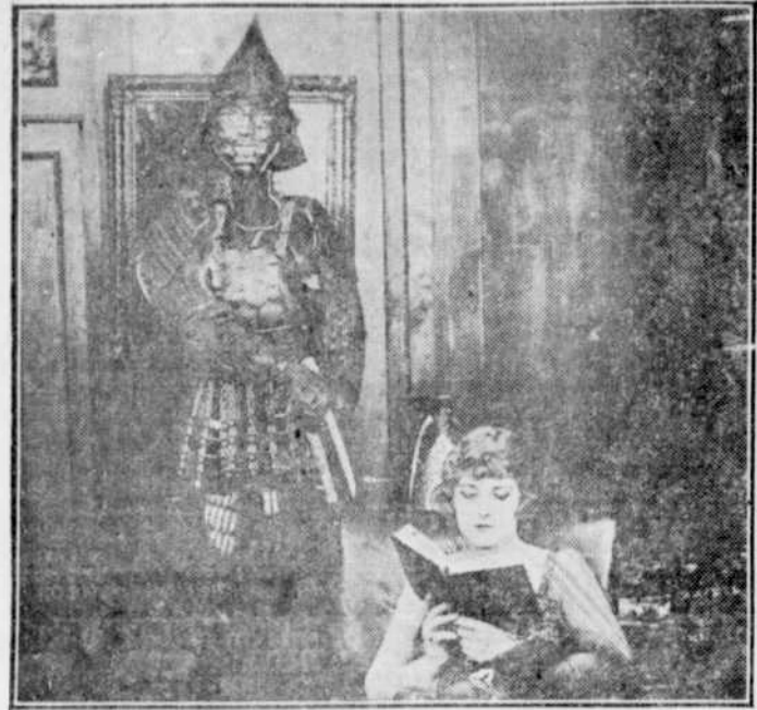
A SCENE FROM "THE IRON CLAW," CHAPTER No. 7, (PATHE)

Items of Interest to Those Who Are Interested in Motion Pictures— Information of Coming Attractions and Comment on Pictures