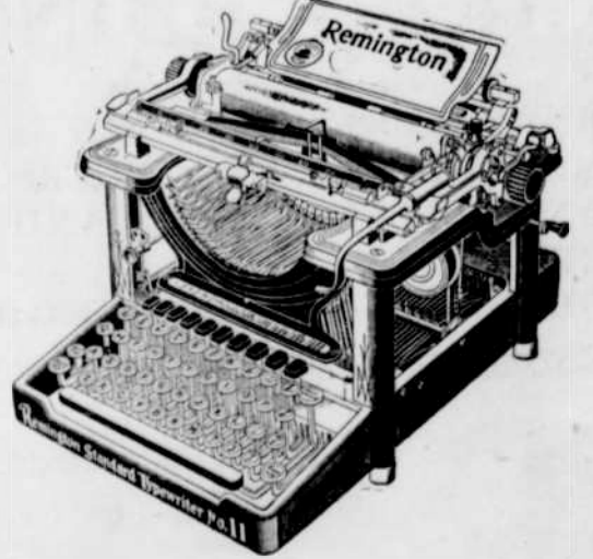
Visible Models 10 and 11

The superior strength and durability of the Remington and its greater reliability under every condition of service have always been recognized. In addition, every contribution to recent typewriter improvement has been a Remington contribution. The FIRST COLUMN SELECTOR, the FIRST BUILT-IN DECIMAL TABULATOR, and the FIRST ADDING AND SUBTRACTING TYPEWRITER are four recent Remington improvements, every one of which constitutes a mile stone in typewriter progress.