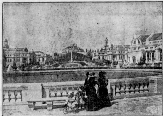
A VIEW OF THE COURT OF HONOR, A.-Y.-P. EXPOSITION, SEATTLE.

FOR SALE. A beautiful parrot, $10. Inquire at this office.