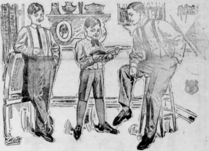
A complete line of