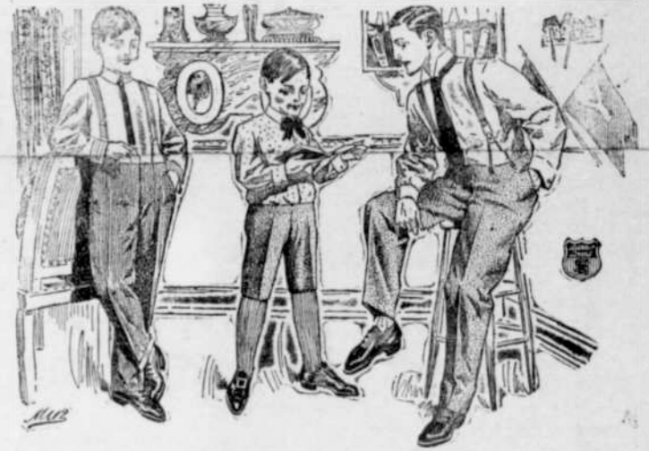
A complete line of

BRICK, LUMBER, SHINGLES, GROCERIES, GENERAL MERCHANDISE.