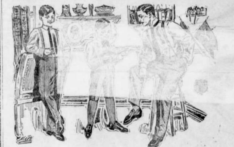
A complete line of

BRICK, LUMBER, SHINGLES, GROCERIES, GENERAL MERCHANDISE.