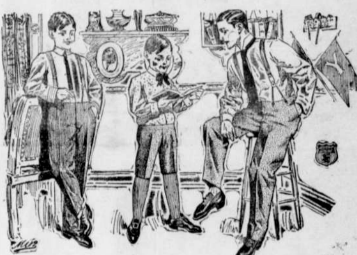
A complete line of

BRICK, LUMBER, SHINGLES, GROCERIES, GENERAL MERCHANDISE. We carry a complete line of Men's and Boys' Clothing. Our stock is new and the latest.