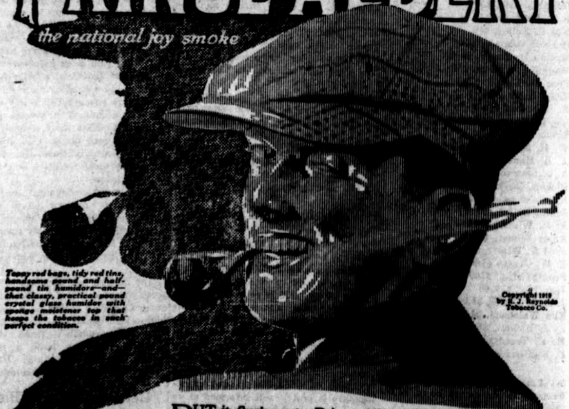
Tasty red bags, tidy red tin, handsome stand, and half-pound tin humidors—and that classy, practical second crystal glass humidior with sponge moistener top that keeps the tobacco in such perfect condition.

Copyright 1919 by R. J. Reynolds Tobacco Co.