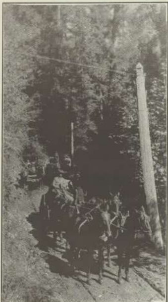
COOS BAY WAGON ROAD