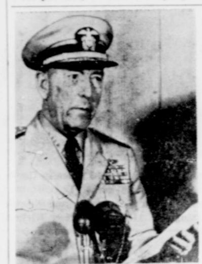
"HALT REDS!" . . . Admiral Arthur Radford, Chairman of Joint Chiefs of Staff, warned House foreign affairs committee "free world can't allow Communists to take over any more nations."