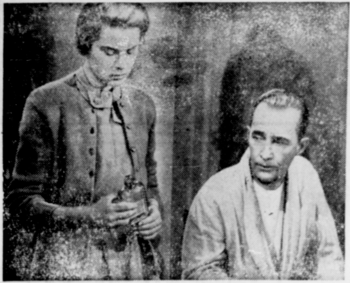
Bing Crosby and Grace Kelly as husband and wife in Paramount's 'The Country Girl'...