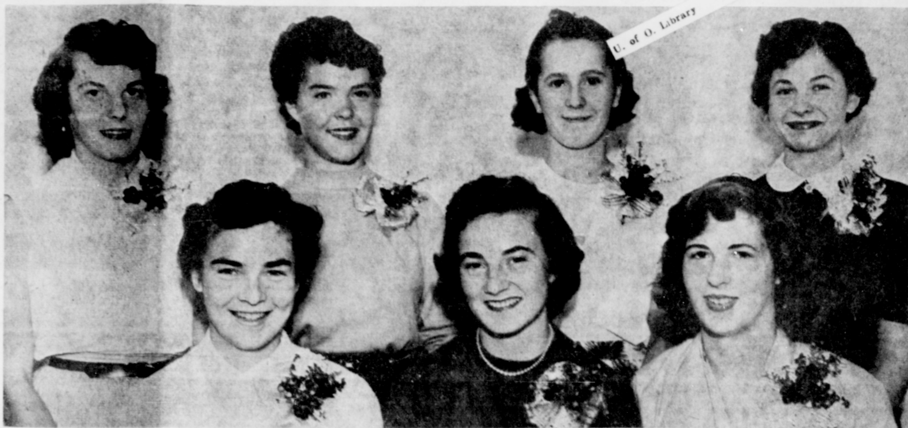
CRANBERRY ROYALTY —These charming Coos county girls make up the royal court of the annual Cranberry Festival at Bandon which celebrates the gallant red berry's history in Coos county each year. One will be named Queen Friday night in special coronation ceremonies at the Bandon school gymnasium. A full two-days program has been arranged at Bandon for the Cranberry Festival with a festival parade Saturday morning at 10:30; a Cranberry Fair at the V.F.W. hall Friday and