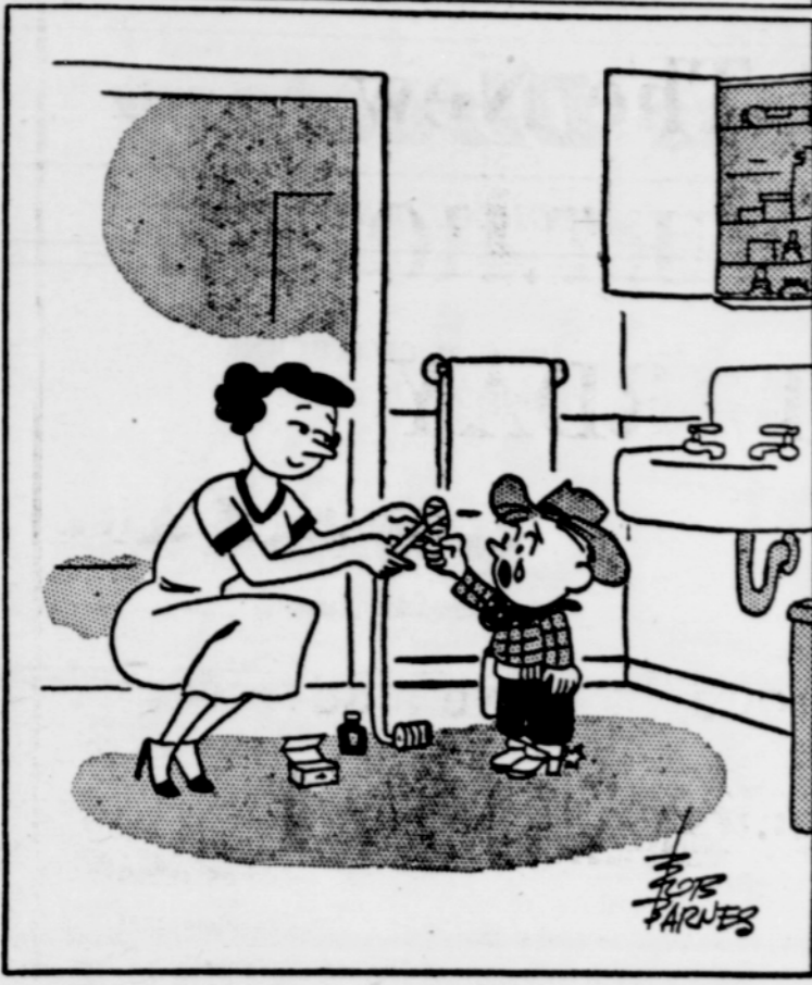
"I'll bet cowboys do too cry when it's their trigger finger!"