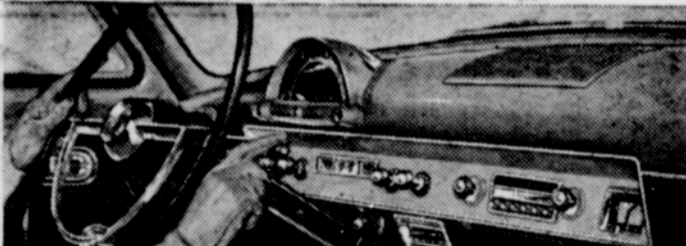
New Astra-Dial Instrument Panel is a safety dividend with speedometer placed high on the panel for easier reading. Warning lights tell when generator is discharging or oil pressure falls too low.