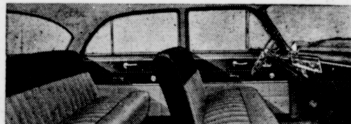
Style-Setting Interiors in Ford give you beauty from the inside out! Colorful new upholstery fabrics and smart trim are another '54 Ford dividend . . . help make Ford the style leader of the industry.