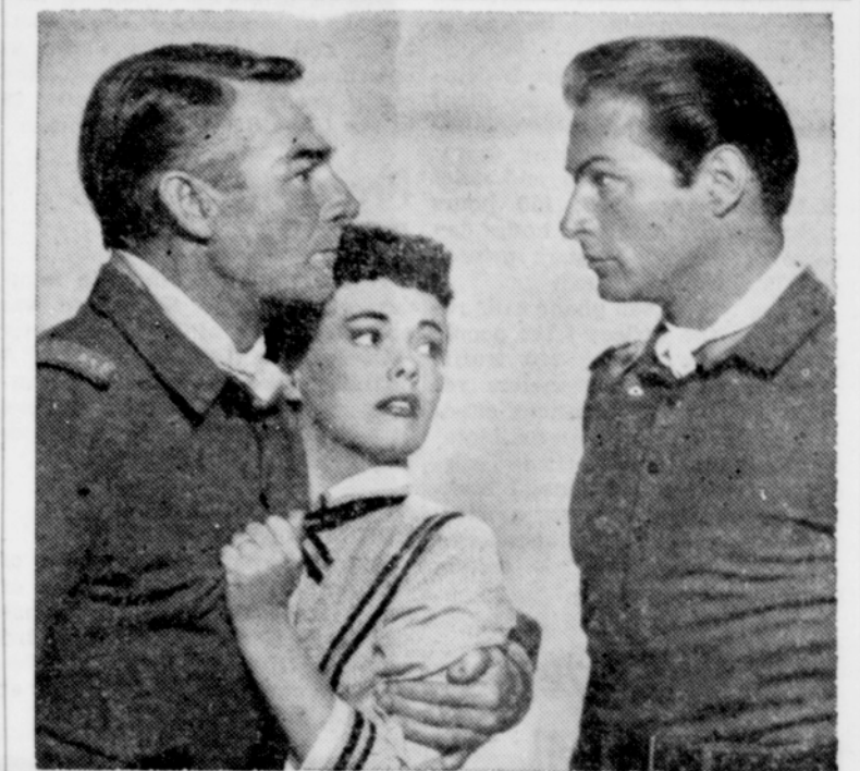
Randolph Scott, Lex Barker and Southwest, "Thunder Over The Phyllis Kirk star in Warner Bros. outdoor adventure of the wild Plains," now showing at the Roxy.