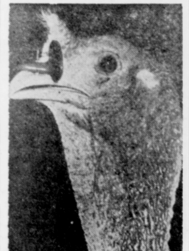
TURKEY SPECS . . . This turkey at London's national poultry show wears device, not to aid vision, but to prevent him from pecking his farm pals.

Coquille high school's girl's sextette were honored recently when asked to sing at the Order of the Eastern Star. Observers remarked that the girls did not only sing well but the group looked lovely as they were dressed in formals to suit the occasion.