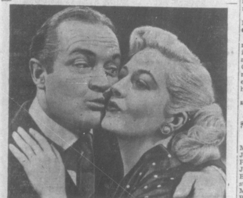
BOB MORE and gorgeous Marilyn Maxwell find time for billing and cooing during the hilarious doings in "The Lemon Drop Kid," Bob's new Paramount comedy which comes to the Roxy Theatre Wed., Thurs., Fri and Sat.