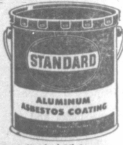
A Standard Oil Company of California Product

Standard Aluminum Asbestos Coating actually adds years of service to roofs. Call us about it today. We'd like to show you the service that has helped us grow in this locality.