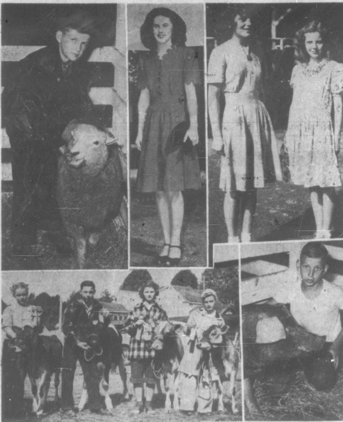
FROM THE PAST YEARS these youngsters remember their days at the Coos county fair, and next Thursday, August 24th, will find many of them making their entries for the big Coos county fair which opens Thursday, to close again Sunday night, August 27th.

CRANBERRY MEN TO ASSESS THEMSELVES $5.00 PER ACRE Southwest Oregon Cranberry club voted Friday of last week to assess every grower $5.00 per acre toward defraying the cost of filing an appeal against the state tax commission ruling on