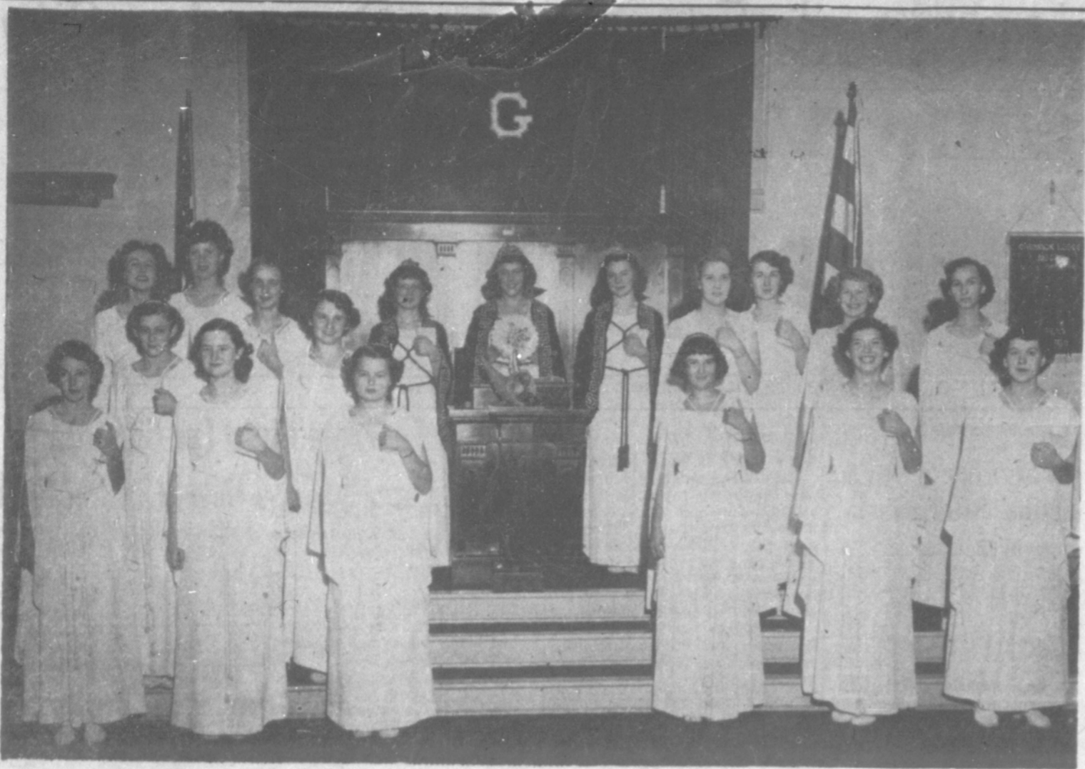
RECENTLY RETIRED OFFICERS of Coquille Bethel, No. 15, Daugh-which will be underway Thursday, Friday and Saturday in Co-terns of Job, who will take an active part in Grand Session activities.