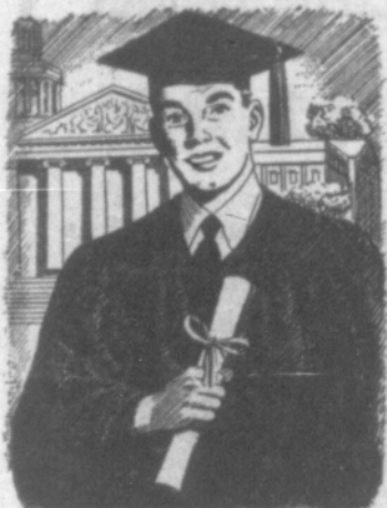
230 universities, educational institutions