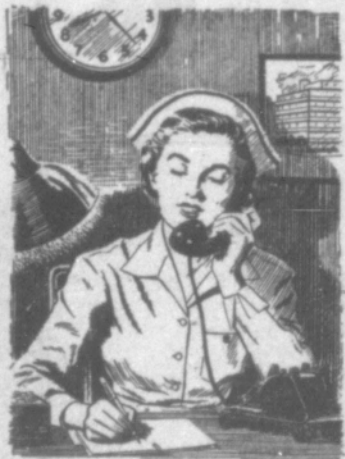
147 hospitals and other medical groups