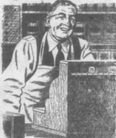
1,825 small and large businesses