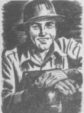
3,500 Standard of California employees