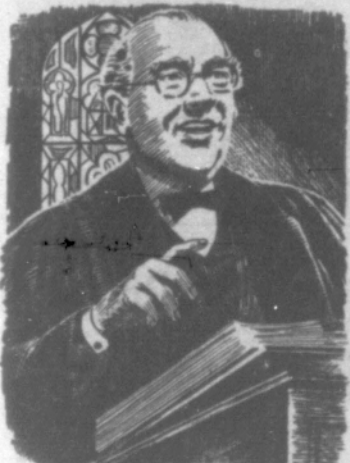
219 churches, religious organizations