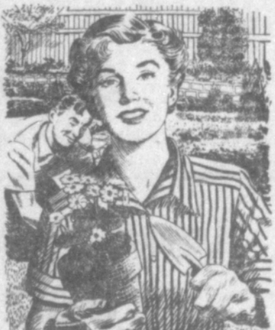
91,000 Americans who invested their savings