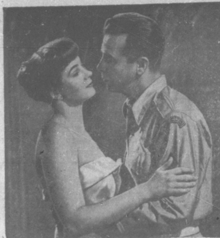
DICK POWELL, as a member of the French Foreign Legion, answers Maria Toren's call to arms in "Rogues' Regiment." The Universal-International adventure film deals with the tracking down in the Orient of a Nazi war criminal. Vincent Price is also starred. At the Roxy theatre Tues., Fri. and Sat.