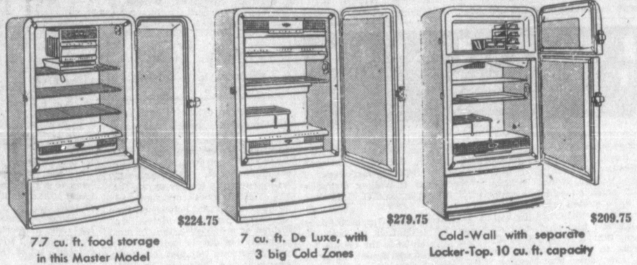
7.7 cu. ft. food storage in this Master Model $224.75

Come in. Learn about all 9 Frigidaire 1948 models and convenient terms which can be arranged.