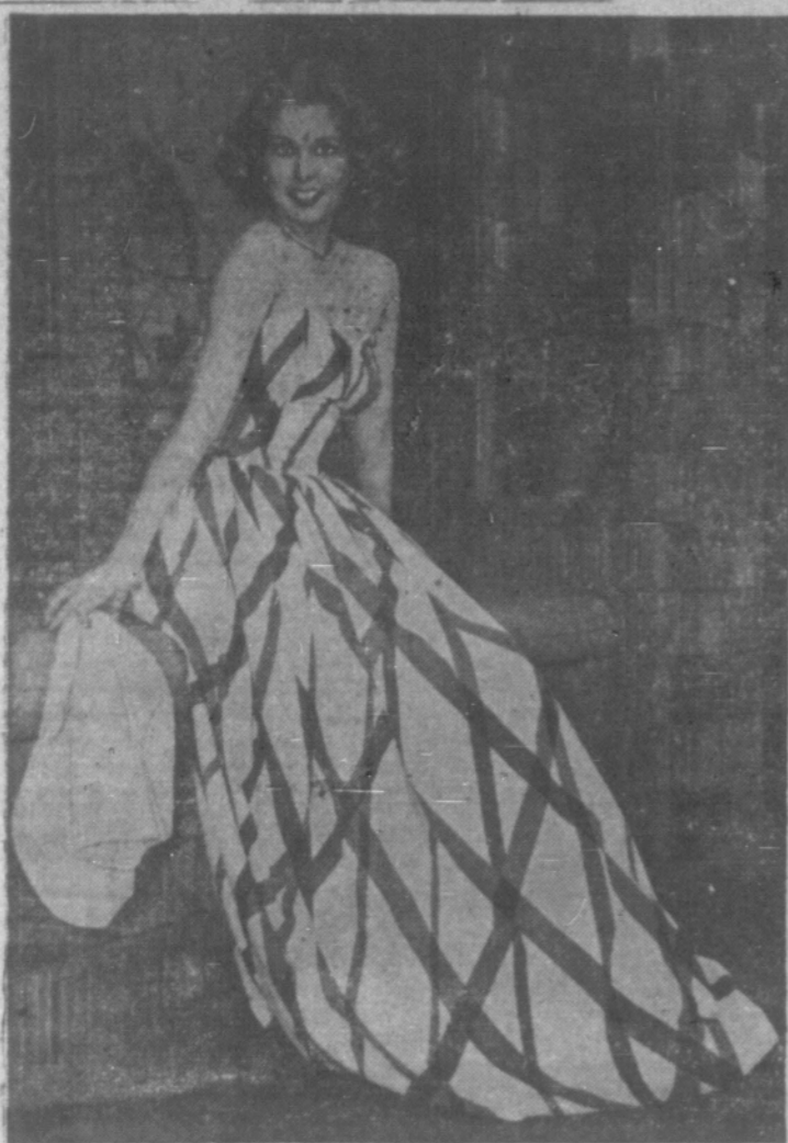
COTTON GOES FORMAL in a beautiful, abstract print with a cover-up bolero in matching fabric. A zestful creation, modeled by Eagle Lion Star, Arlene Dahl.