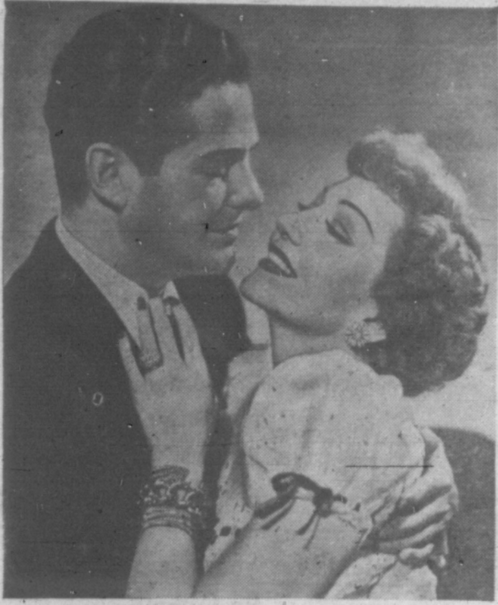
ROBERT CUMMINGS AND CLAUDETTE COLBERT in one of the lighter scenes from the tense, emotional film, "Sleep, My Love," which opens Sunday for three days at the Roxy Theatre. It is a Triangle Production, released by United Artists.