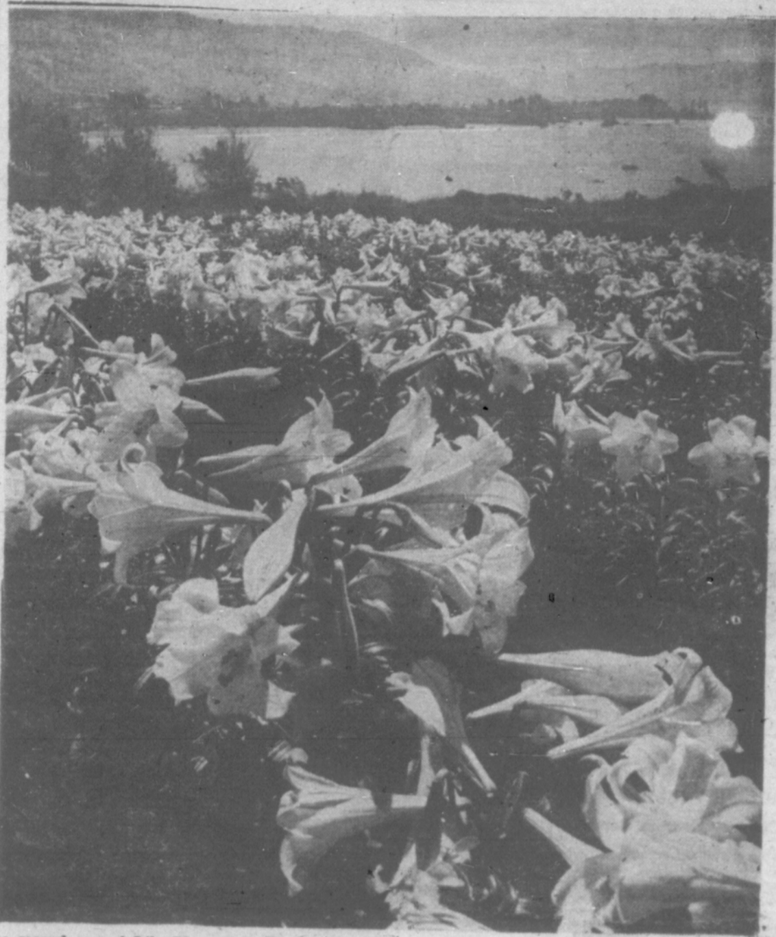
The second annual Lily Blossom Festival will be held at Brookings, Oregon, on Saturday and Sunday, July 17th and 18th.

Program consists of: Saturday, Conducted tours of hundreds of acres of Easter Lilies; Sunday, Grand Floral parade with over 40 beautifully decorated floats using lilies entirely. The only parade of its kind in the world. This will be screened by Fox Movie Tone News. Parade at 2 P. M. 9 P. M. Fireworks display on the beach.