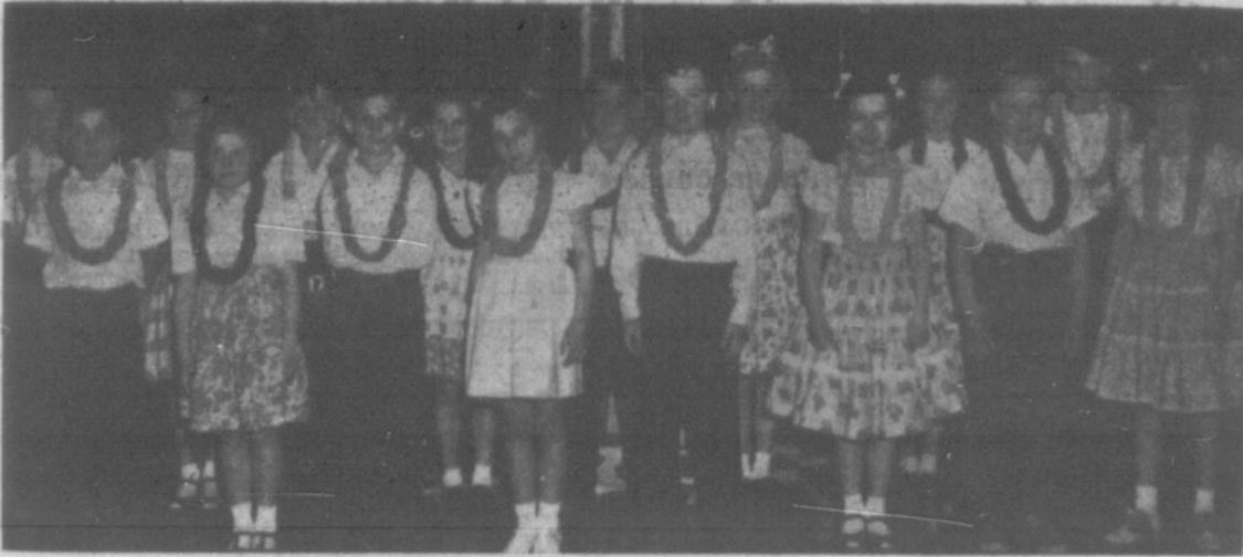
MAY POLE WINDERS—They wound the May Pole, and a colorful affair it was too, Saturday evening at the Coquille Woman's club May Day fete.