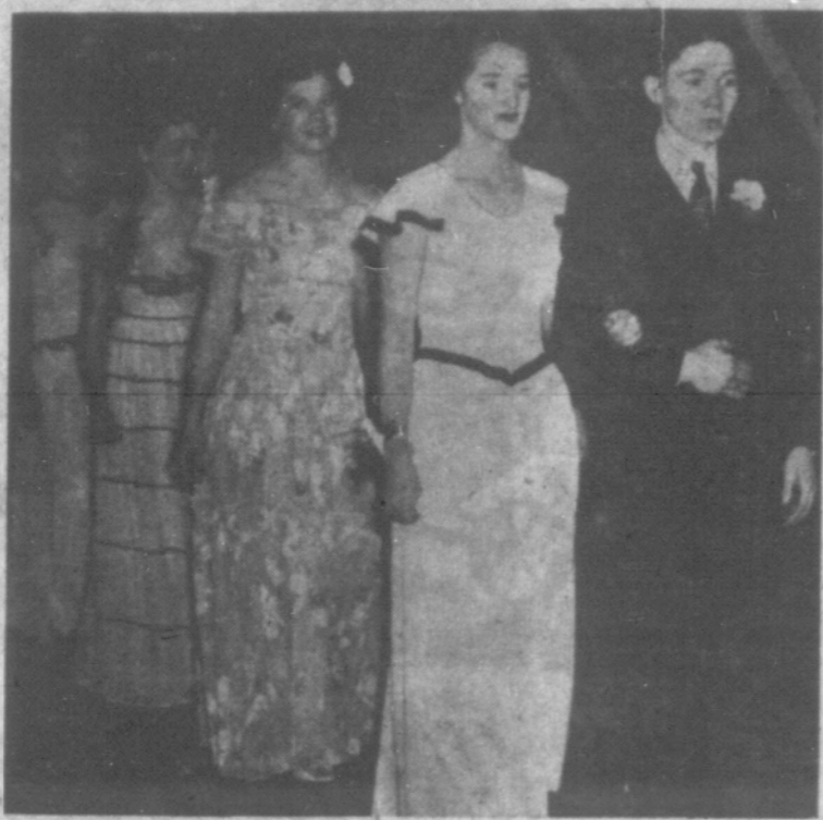
POWERS —The Senior Ball queen and her escort lead the formal procession at the start of the annual Powers high school formal dance. In a colorful and lovely march, the entire student body executed intricate marches throughout the high school gymnasium.