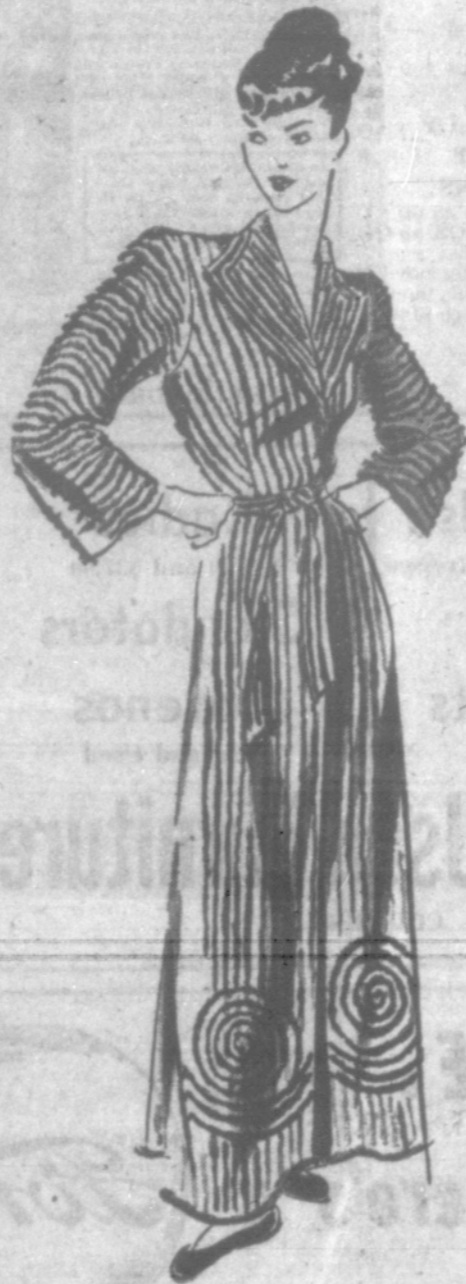
Chenille Robes $7.05

For lovely evenings at home, cozy tufted robes of warm cotton chenille, with slim, figure-flattering lines. Colors as glowing as the fireplace. Cherry, dusty, aqua and light or royal blue in the group. Also lovely quilted chintz robes in yellow, blue and white.