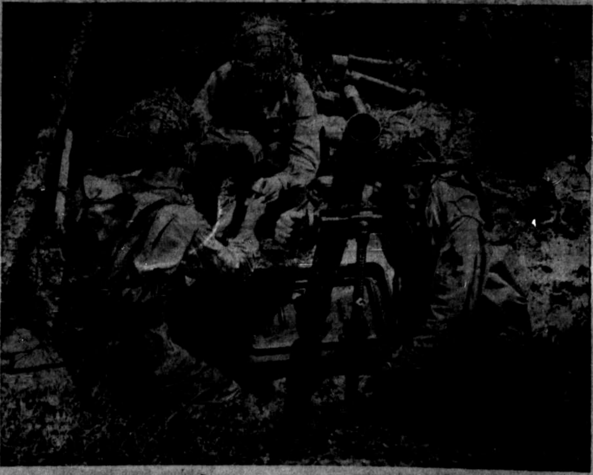
CRACK WEAPONS CREW PUTTING HEAVY MORTAR IN ACTION: Combat Infantrymen from The Infantry School, who will take part in outdoor weapons and combat demonstration "Here's Your Infantry" as a highlight of $14,000,000,000 Sixth War Loan Drive opening November 29. Coast-to-coast show, with premiere in Washington, D.C. on November 11, is produced by The Infantry School of Army Ground Forces in cooperation with the War Finance Division of Treasury Department.