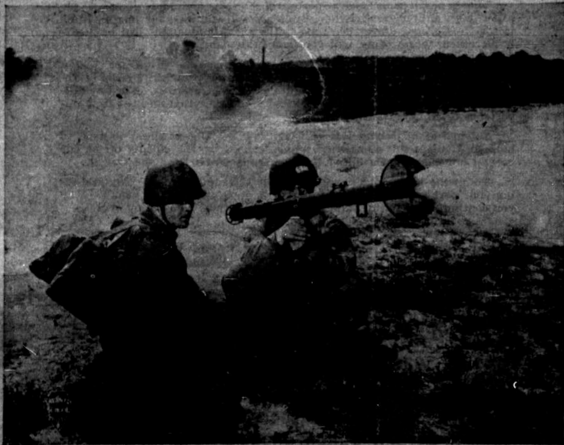
ROCKET TEAM DEMONSTRATES BAZOOKA: A 20-man demonstration unit of combat Infantrymen will exhibit this Infantry weapon in the spectacular outdoor weapons show, "Here's Your Infantry" which features highlights of $14,000,000,000 Sixth War Loan Drive produced by Army Ground Forces and the War Finance Division of the Treasury Department.