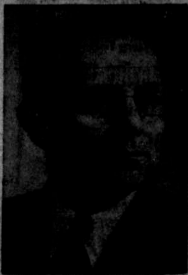
U. S. Senator GUY CORDON