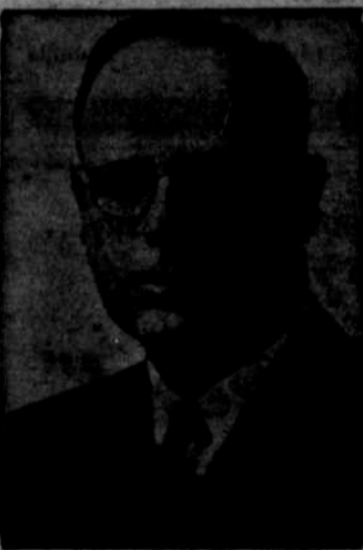
U. S. Congressman HARRIS ELLSWORTH