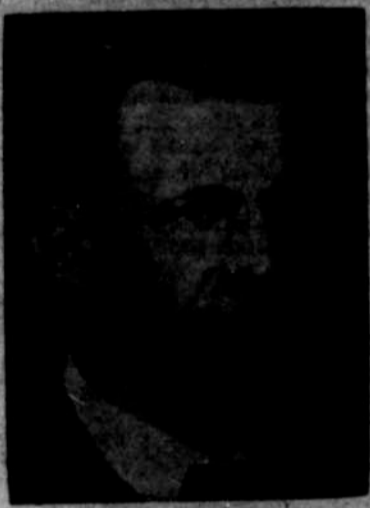
State Senator WM. E. WALSH