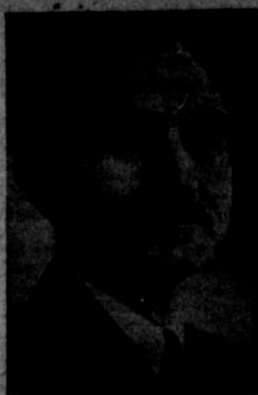
U. S. Senator WAYNE MORSE