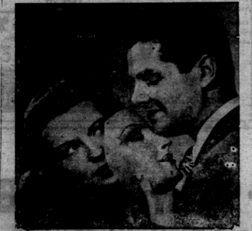
BETTY FIELD and Robert Cummings provide surprising romantic thrills in Universal's "Flesh and Fantasy" in which they are co-starred with Robert Benchley, Edward G. Robinson, Charles Boyer, Barbara Stanwyck and others.