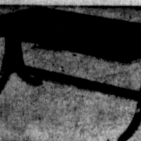
Walnut Cocktail Tables $10.50