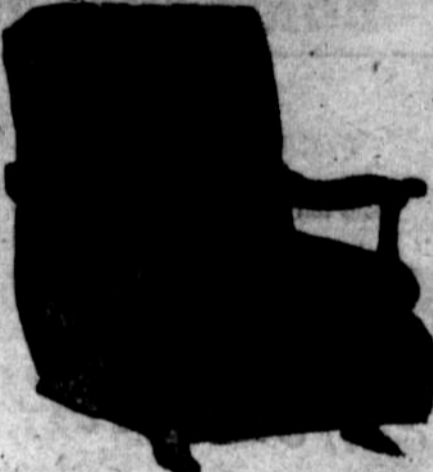
PLATFORM ROCKER... $49.95

35c per quart quality, 100% Pure Pennsylvania Crude, refined under Permit No. 673 of the Pennsylvania Grade Crude Association. Dewaxed, Double Distilled, and Specially treated to flow quickly in cold, stay "Oily" in heat. Use "Penn Supreme" to protect your motor under difficult war-time driving.