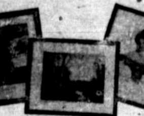
Beautiful Floral Pictures $1.39