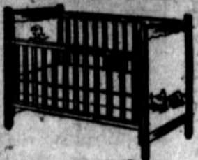
BABY CRIBS $14.95 up

28x52... colorful "Nevo-Wat" tick Felted cotton filled -foam edges. Two turning handles. $8 95