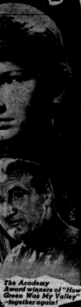
The Academy Award winners of "How Green Was My Valley" — together again!

LASSIE COME HOME IN THRILLING TECHNICOLOR with RODDY McDOWALL DONALD CRISP