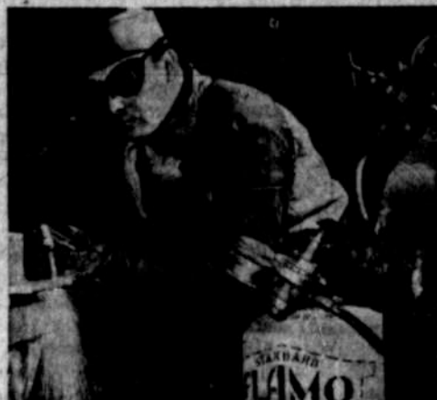
Carrying a torch for victory, this burner slices steel speedily and accurately with one of Standard of California's industrial gases.

Peering through a quartz window into the combustion chamber of a running engine, this Standard of California technician can actually see how a new gasoline will behave in your motor. He will check it for speed and smoothness of combustion so that when Standard Gasoline goes into your car's tank you'll get "Unsurpassed" power and performance.