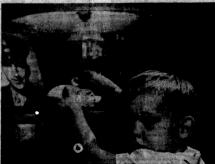
Buying daddy's ticket home, he helps "back the attack," saves to invest in an extra Bond during the Third War Bond Drive.