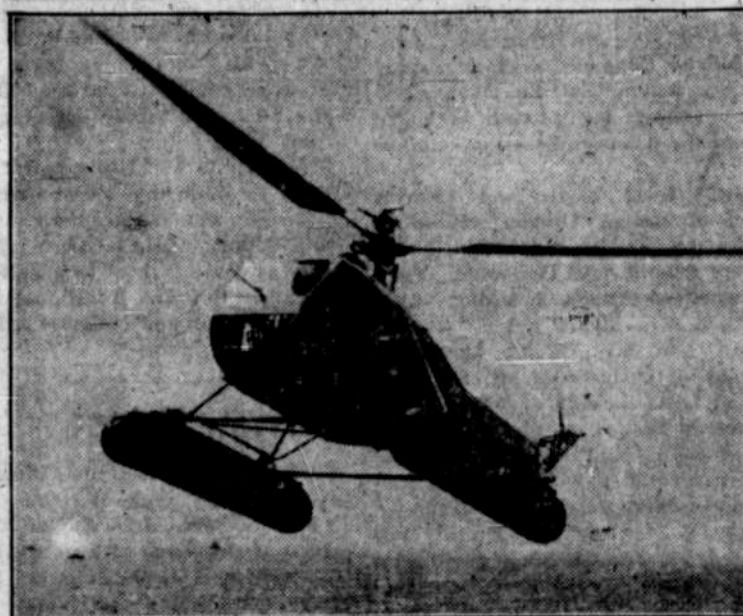
This Sikorsky type of helicopter, which will be built in quantity for the Army Air Forces by Nash-Kelvinator Corporation, peacetime manufacturer of automobiles and refrigerators, can alight on land, water, snow, thin ice, a rooftop or a parking lot. The craft can hover motionless in mid-air; descend and ascend vertically without forward motion and fly backward, sideways or forward with equal facility.

or a fine billfold, shop at Norton's. We have just received a large supply and by fall they will be practically off the market.