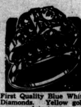
First Quality Blue White Diamonds. Yellow gold plate top

A beautiful Havel in the charm of Coral Gold. Only 14.95