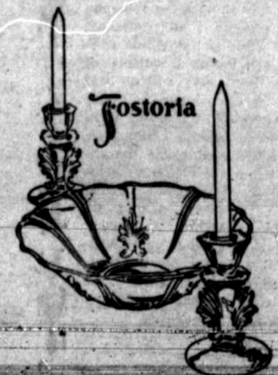
For Decorative Table Settings