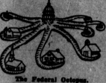
The Federal Octopus.

"The time has now come to reassert the principles of a limited federal government, because if this