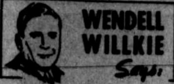
WENDELL WILLKIE Says: