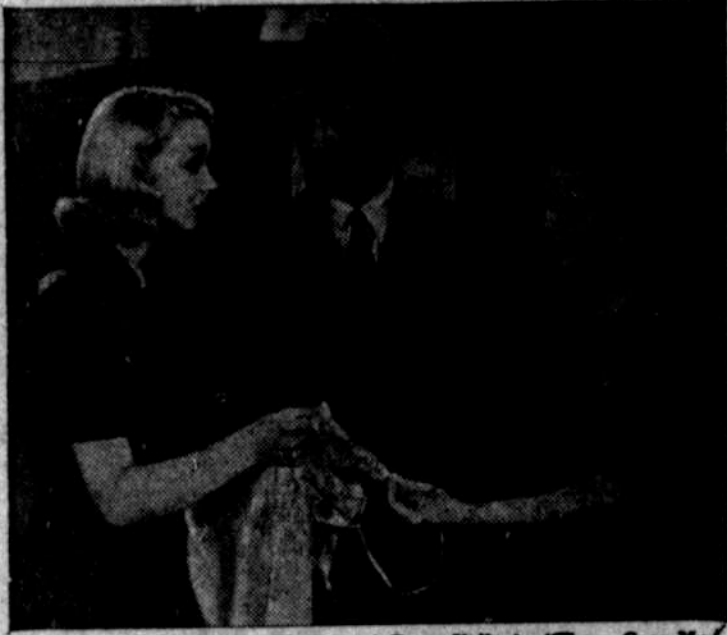
Virginia Bruce, Fredric March and Patsy Kelly in "There Goes My Heart," a Hal Roach production released through United Artists.