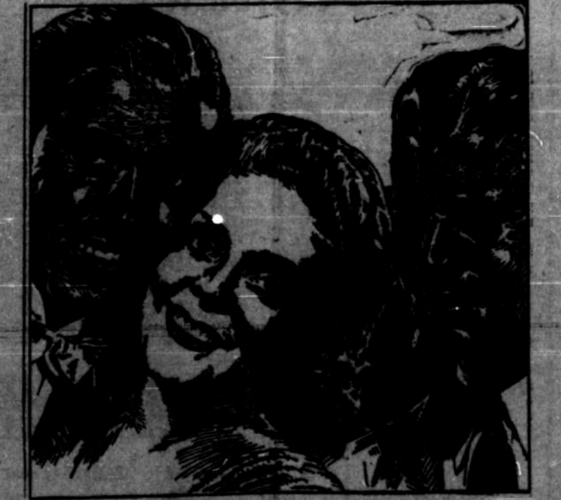
Hot-headed young romance, turbocharged as the times, highlights Irving Berlin's "Alexander's Ragtime Band." Above, the stars of the picture—TYRONE POWER, ALICE FAYE and DON AMECH.

"Alexander's Ragtime Band" At Roxy Sunday, Monday, Tuesday