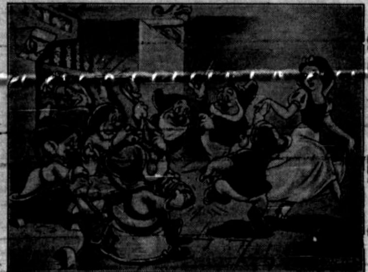
In Walt Disney's full-length feature, "Snow White and the Seven Dwarfs," the heroine sings several songs. One of them is heard in the above scene from the RKO Radio Picture produced in Multiplane Technicolor.