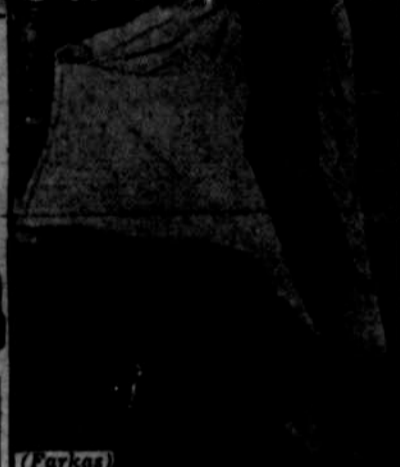
SYLPH IN SATIN . . . Cape of white terry cloth sets off marine blue of latex slipper satin swim suit worn by this slim socialite at British Colonial as she prepares for dip in surf off Nassau.