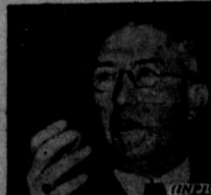
WARN U. S. TO ARM . . . Glenn L. Martin (left), designer of "Clipper" planes, told House Naval Affairs committee of plans for 250,000-pound bomber and urged air armaments be doubled; Assistant Secretary of Navy Charles Edison (right) says he is in advance defense.