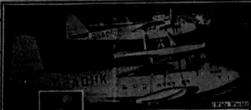
AERIAL HITCH-HIKE . . . Revolutionary "pickaback" airplane, shown here in test at Rochester, England, takes off as one plane, lands as two, for small seaplane can leave "mother-ship" at 700 feet.