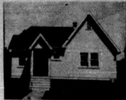
New Home Just Completed by us under contract

LET US FIGURE ON YOUR NEW JOB OR REMODELING