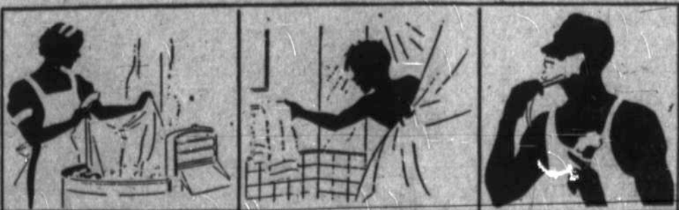
Piping hot for laundry wash! Grand hot water for the shower! Just "prime" for shaving lather!

Time was when the water for baths had to be heated in tea-kettles and big pans on top of the coal-stove. Time was also when the small heater had to be lighted and then one impatiently waited for twenty minutes at least before there was hot water. Then there was only enough for one person's bath. Now the whole family draw on the various faucets of the house at one and the same moment. The shower is in use, there's shaving going on, the laundry is in action, there's dish-washing in the kitchen. Plenty of water for all and every bit is "piping hot"! If that isn't luxury, what is? And at a cost so trivial! Those who haven't enjoyed this modern luxury of instant hot water should telephone at once for a heater to be installed.