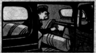
LEGROOM SPACE IN SEAT—Behind the rear seat of all Tudor and Fordor models. Back of seat pulls forward permitting easy access.