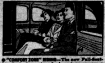
"COMFORT ZONE" SEATING—The new Full-dressing Springback gives back seat passengers a "front seat ride." The Springback is now 134".