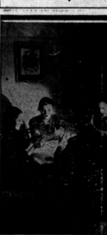
When the so-called "bridge lamp" is used to light a game of bridge, as above, its nature and purpose have been misunderstood. At right is shown a correct type of lamp for the purpose.

By Jean Prentice MISPLAYED hands, sharp words exchanged across the bridge table—these are frequent indications that the "bridge lamp" has been misnamed. So-called because its extension arm holding the shade and bulb has been built on the principle of the cantilever bridge, the bridge lamp was really designed as a reading lamp, and not to play bridge by, at all.