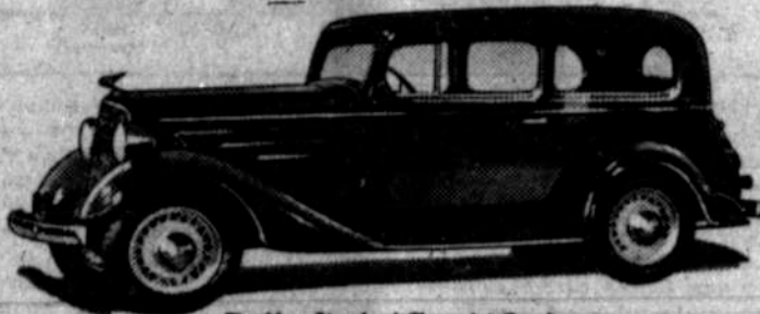
The New Standard Chevrolet Coach

CHEVROLET MOTOR COMPANY, DETROIT, MICH. Compare Chevrolet's low delivered prices and easy G. M. A. C. terms. A General Motors Value